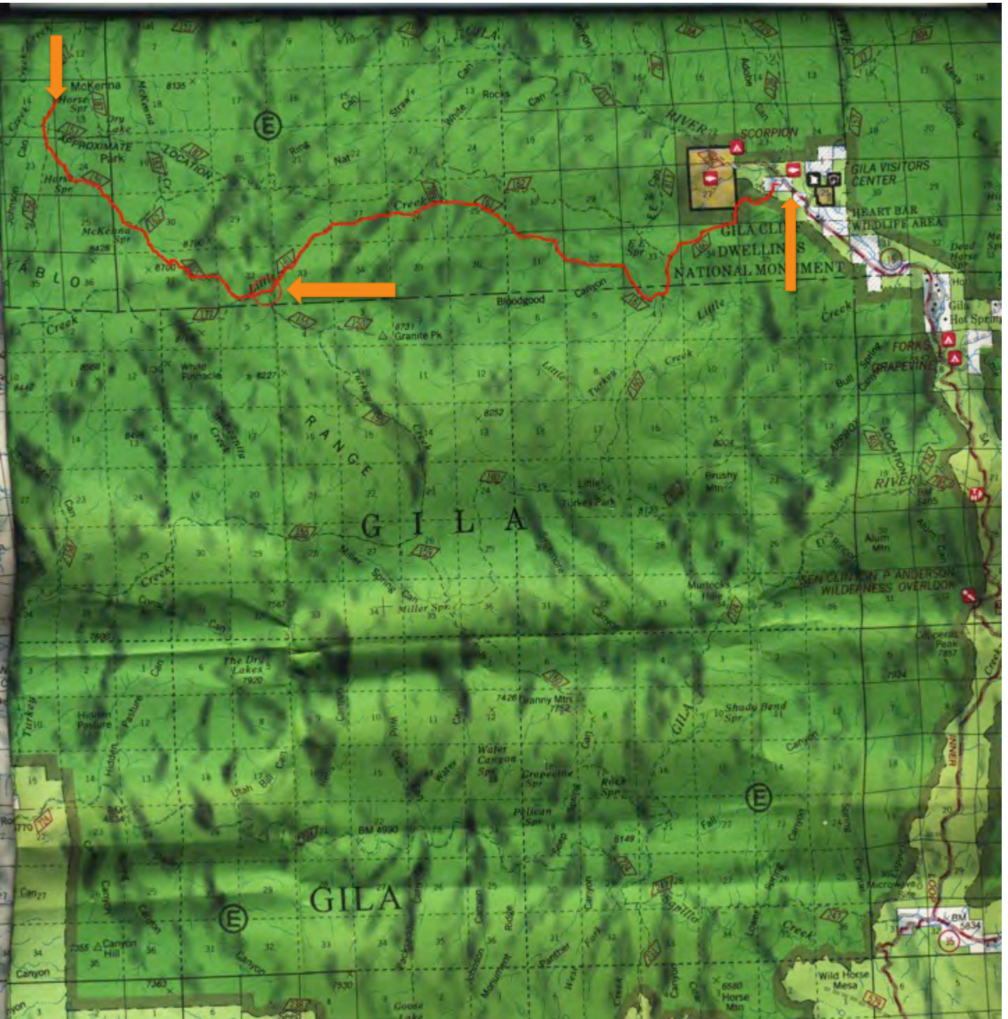
Map 1: Little Creek and McKenna Park (red circle on the trail shows the location of the base camp at Little Spring)